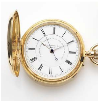
(Pictured above is not an exact photo of the object but very similar)

After about 10 minutes, Jay and Ben exchanged places and Jay began projecting his mental object into the target area. Object: Pocket Watch, no chain, winding mechanism with push to open, Roman numerals on face, 2-3” round when closed, weighs less than a pound, made in 1880, still working, gold color, aged but not destroyed, white clock face, 9:07 time, not valuable but has family value. The sounds of the object would include: Ticking, winding, and closing of watch clasp (click.).